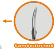
Curved cutter head